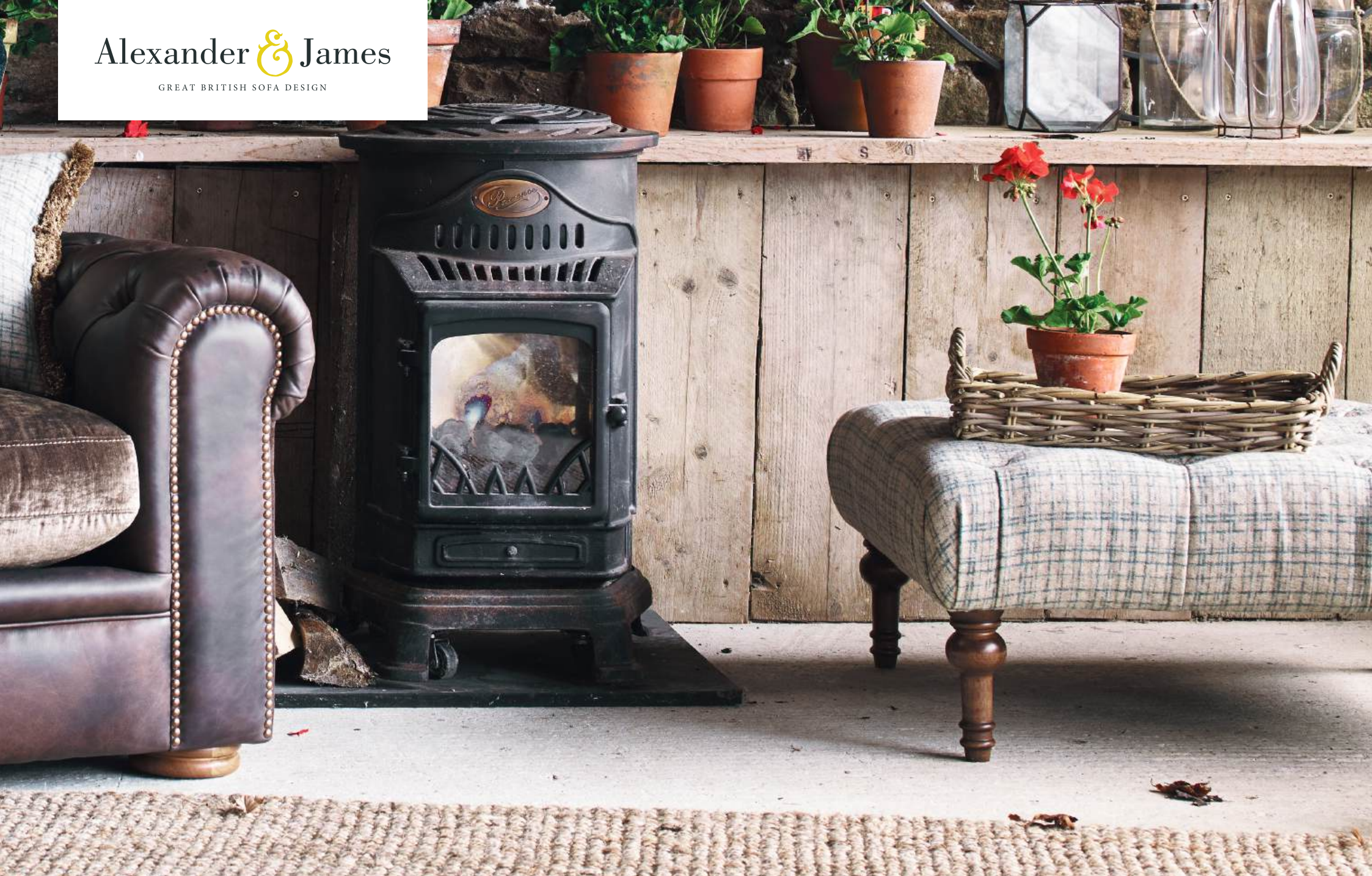
FONTAINE FOOTSTOOL SHOWN IN CADENCE LYRIC BLUE WITH WEATHERED OAK FEET